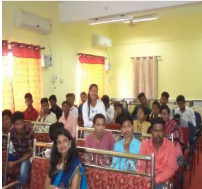
Kavikulaguru Kalidas Sanskrit University