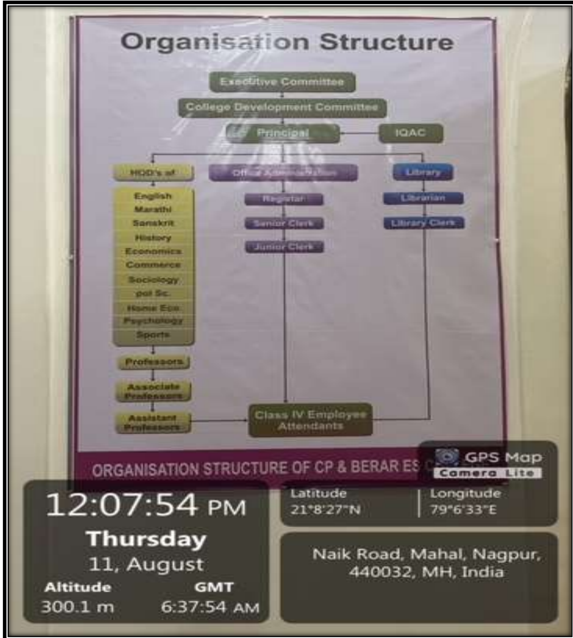
Organogram of Institute as Displaced in the Principal's Chamber

The college has a well-defined method of functioning that is visualized on an Organogram. This Organogram is displayed prominently in the office of the Principal. The hierarchy flows from the management to the Principal, who, in consultation with the IQAC, looks after the everything from policy matters to the day to day running of the institution.