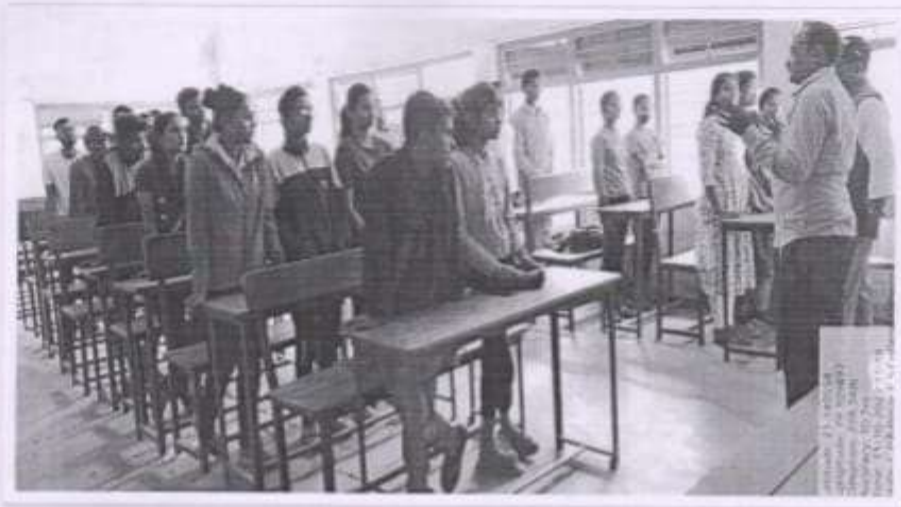
Students at the ceremony were administered the oath by NCCSS program officers on National Unity Day.