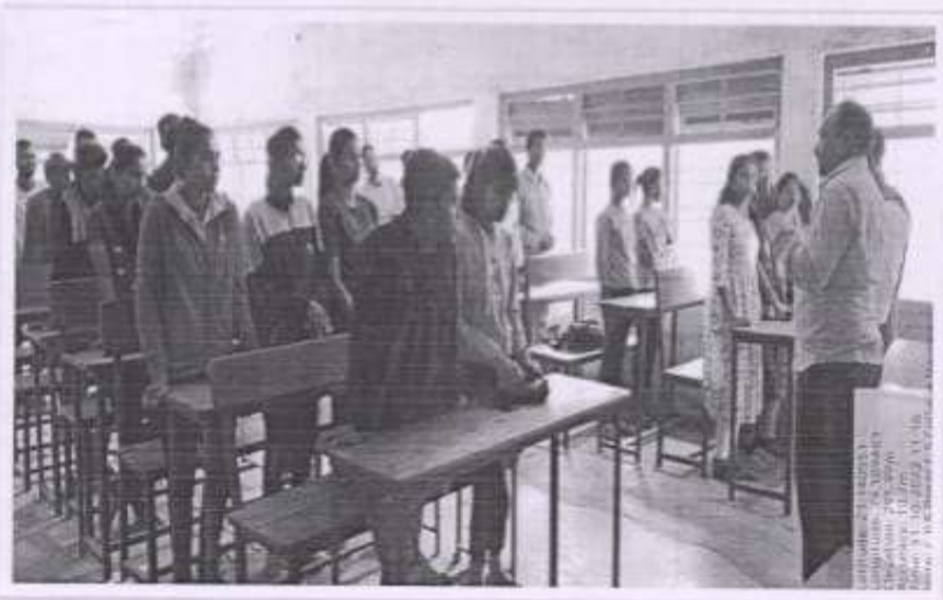
Students at the ceremony were administered the oath by NCCSS program officers on National Unity Day.