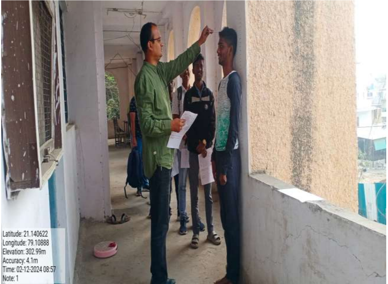
C.P & Berar College Students during Physical Efficiency Test