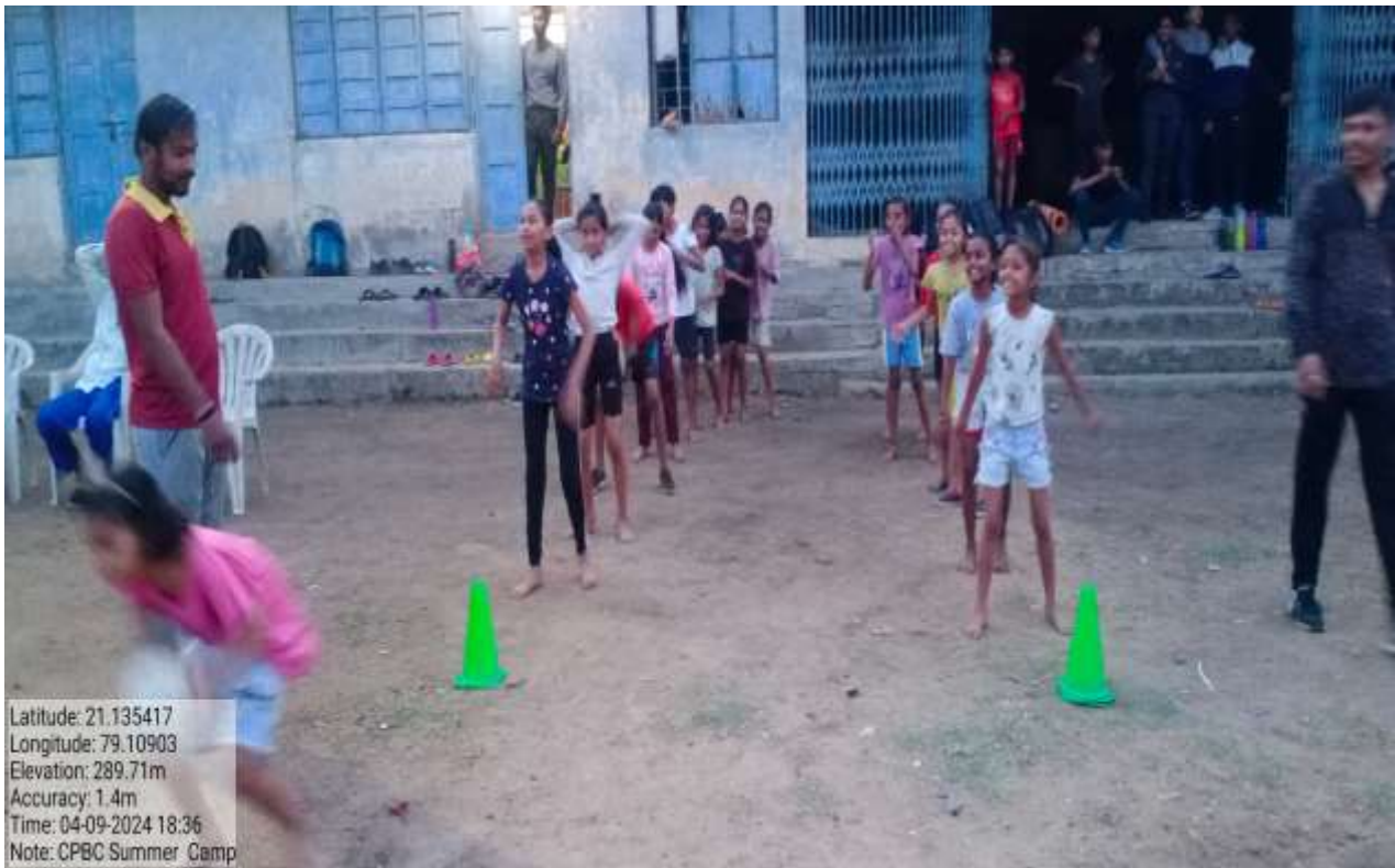
Players in action in Evening Session