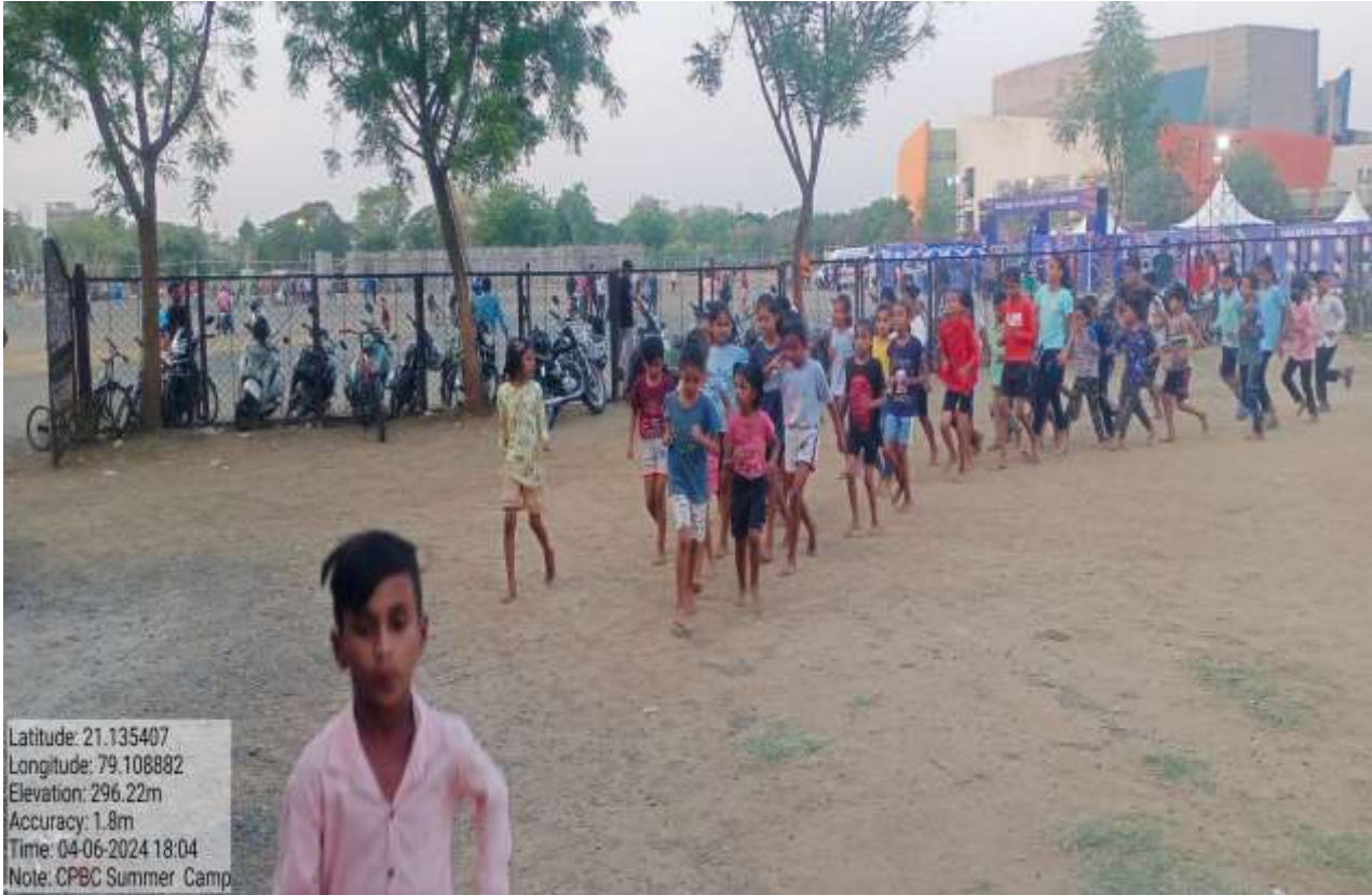
Students performing various drills in Summer Coaching Camp