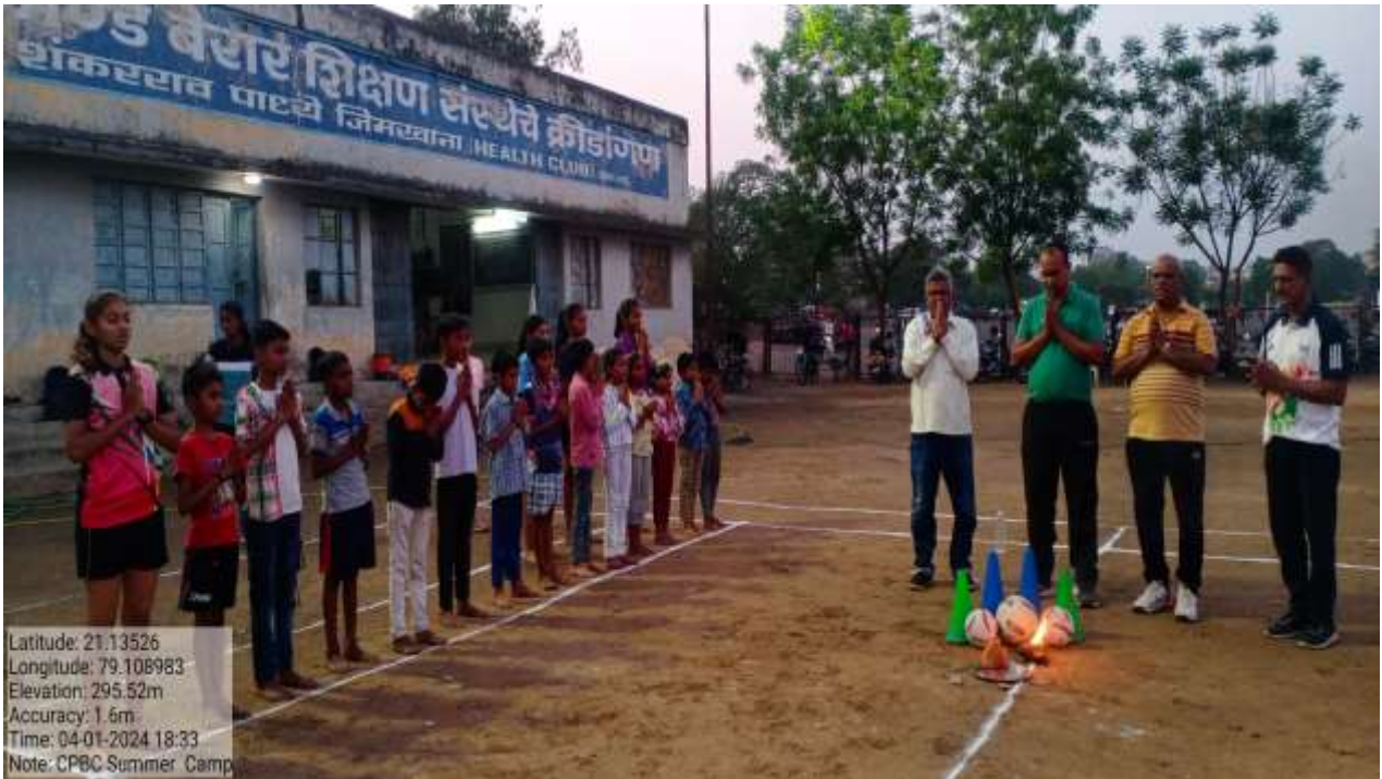
Opening Ceremony of Summer Coaching Camp