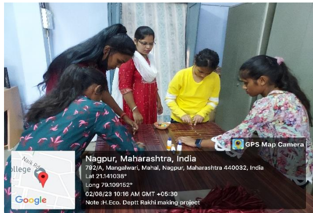
College Students Making Rakhi in Rakhi workshop