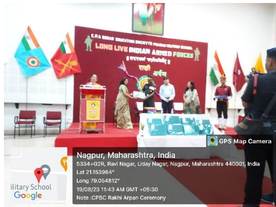
Rakhi Arpan Ceremony at Prahar Military School