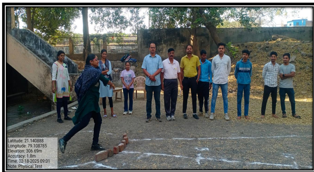
C.P & Berar College Students during Physical Efficiency Test