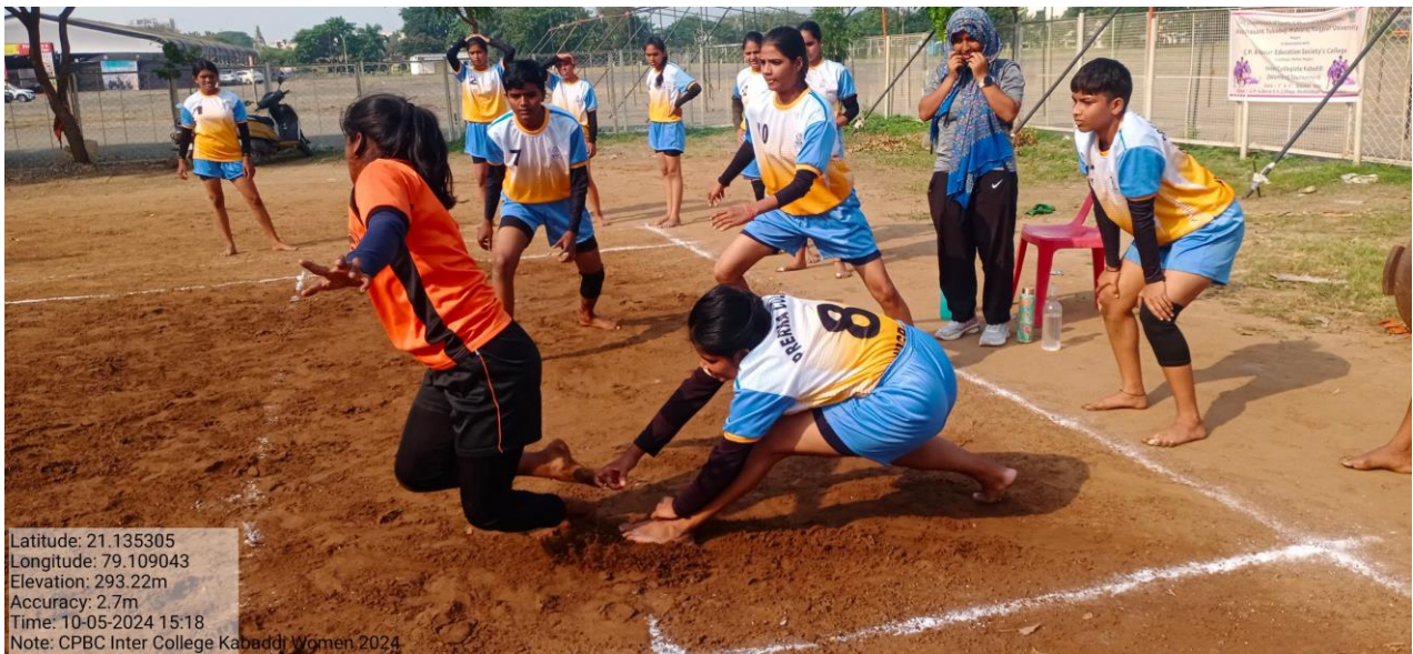
Players in Action in RTM Nagpur Inter Collegiate Kabaddi Women H Zone Tournament (05.10.2024 & 06.10.2024)