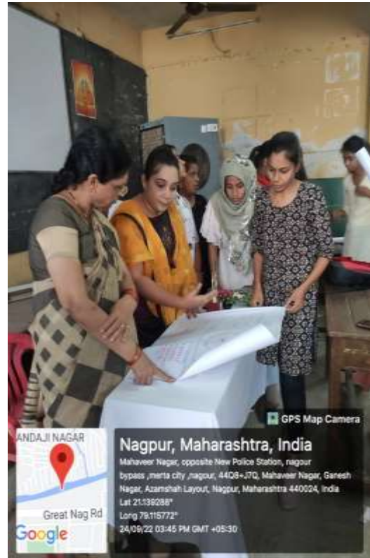
Students busy in their activity while Training Workshop